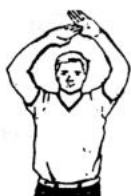
13) Game Time Out