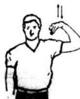
11) Foul - hit above shoulder