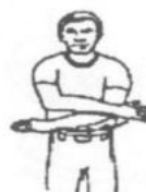
15) Time Up & end of game