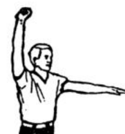
8) Personal foul, indicating player & showing place after watch again